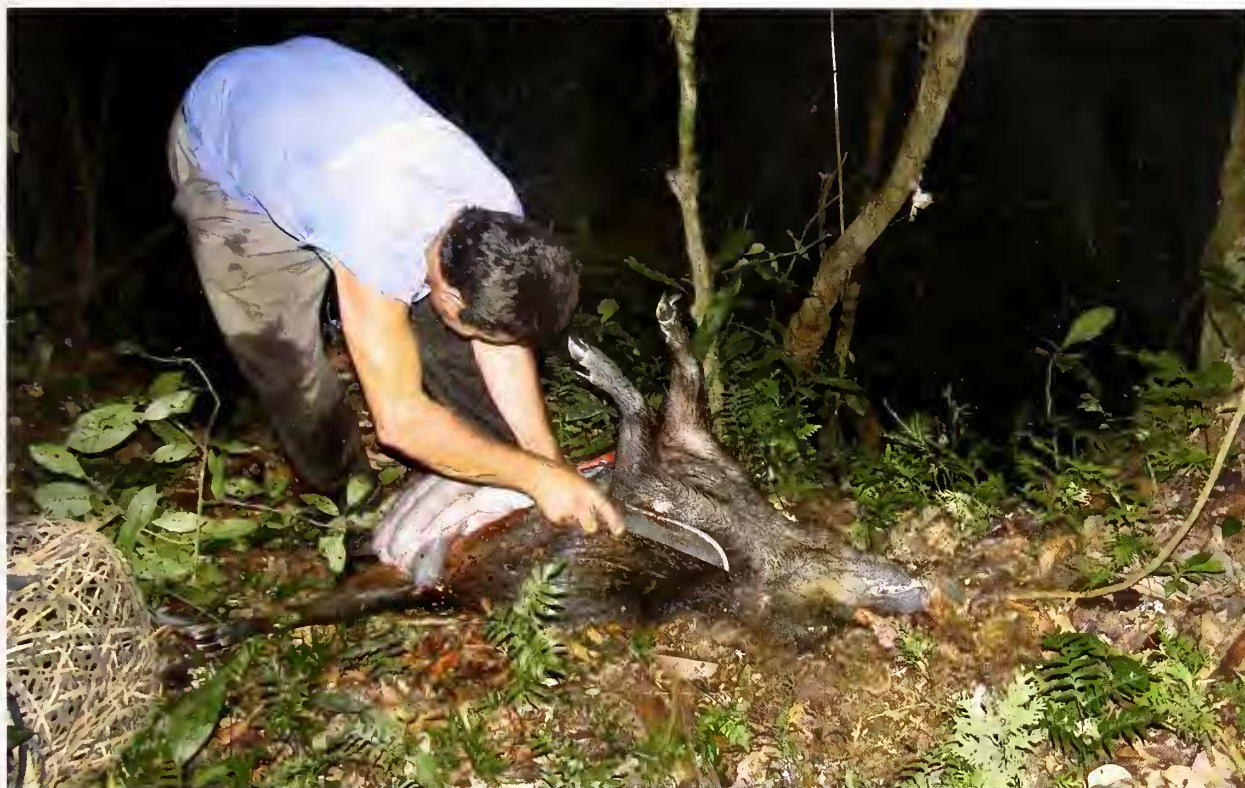
Fig. 3. Local hunter beginning to skin same specimen.

of the cheek area only). The brown dark mottled fur colouration differed from the strongly speckled dark blackish-grey fur colouration of P. tayacu as well as from the blackish brown longer fur of T. pecari . In the figures the differences in fur colour and bristle-haired texture are evident although the freshly killed female pig lay in a forest creek and was therefore wet.